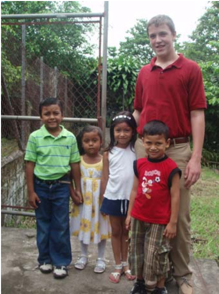
"Grande boy gathers with friends"