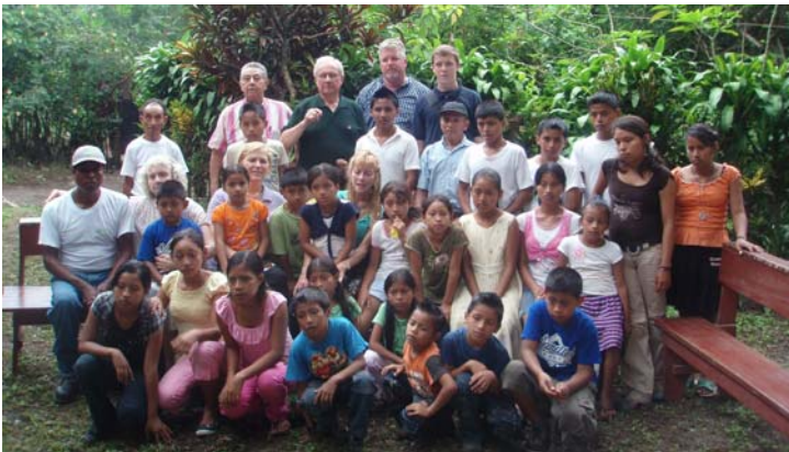
"Gathering at La Ascension"