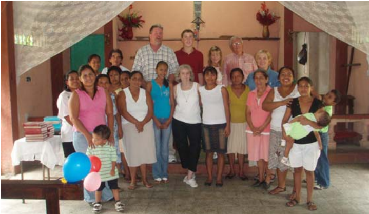
"Gathering at La Anunciacion"

Guatemala Cuisine along with some "Market Day" items will be available.